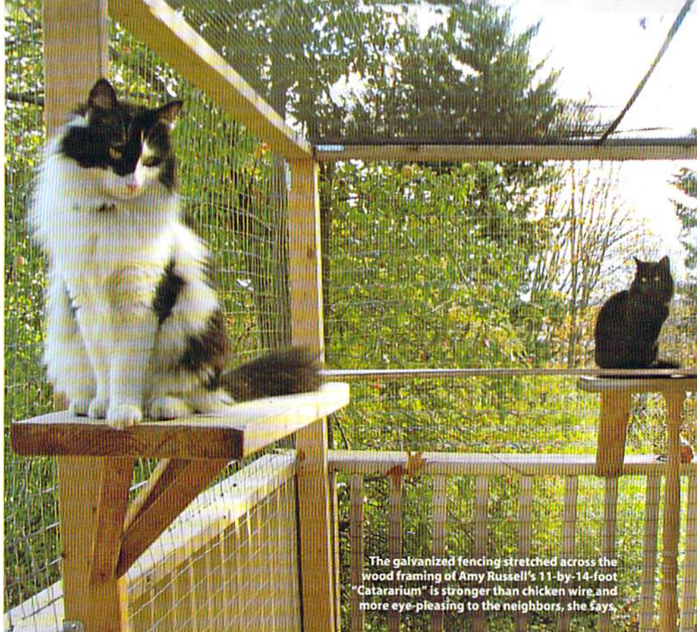
The galvanized fencing stretched across the wood framing of Amy Russell's 11-by-14-foot "Catararium" is stronger than chicken wire and more eye-pleasing to the neighbors, she says.

Other vendors of kitty jungle gyms, perches, and containment systems: cagesbydesign.com catsondeck.com kittywalk.com wildwhiskers.com catsplay.com katwalks.com therefinedfeline.com